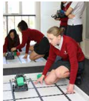
IMAGE: STEAM STUDENTS TESTING THEIR ROBOT SKILLS

Our STEAM program addresses some of these concerns by helping students to make links between subject areas, and to use their creativity to address issues and envisage solutions in a cross-curricular way. It is important to create a field of dreams, establish opportunities for students to experience using subject content in a variety of creative ways, and hence instill a motivation for learning, rather than just learning in subject-isolated arenas.