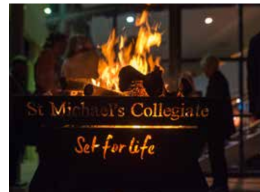
IMAGE: COLLEGIATE'S CUSTOM FIRE PIT AROUND WHICH GUESTS ENJOY A MULLED WINE BEFORE THE EVENT