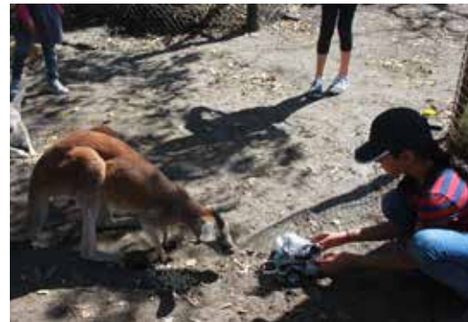
IMAGE: A KANGAROO AT CAVERSHAM WILDLIFE PARK GETS UP CLOSE TO AN IMAGINARIUM PARTICIPANT'S 'ANIMATRONICS' PROJECT

G ifted girls as young as seven are challenging their creativity and curiosity, asking big questions and developing skills for the future through a new programme at Perth College.