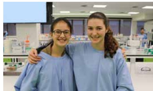
YEAR 10 STUDENTS PARTICIPATING IN CUTTING-EDGE EXPERIMENTS IN THE DEAKIN UNIVERSITY LABORATORY

In the humanities field, students have participated in expert mentoring in fields including law, classics, computational linguistics, music composition, history and psychology, writing and publishing, portrait painting, printmaking, Socratic dialogue and play writing and have represented Australia in two International Computational Linguistics Olympiads. Students also worked with the head curators at the NGV on an extended mentoring opportunity to help design the "Dali-Liquid Desire" Winter Masterpieces Exhibition.