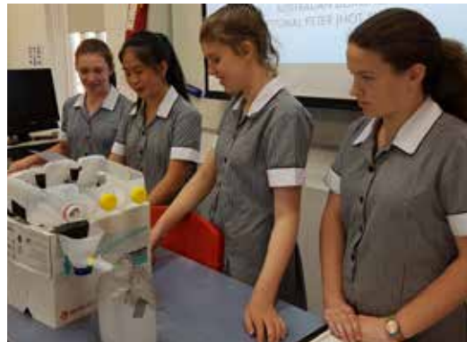
IMAGE: YEAR 7 STUDENTS PRESENTING THEIR WATER STORAGE AND FILTRATION DEVICE

Abbotsleigh was a pilot school for one of the STEM units developed by the NSW Education Standards Authority (NESA) in 2016. Year 7 students used their knowledge and skills in science, technology and mathematics to solve a design thinking challenge involving water use. We took the main ideas from the sample and adapted it to our context. Students completed learning activities in science and mathematics to investigate a series of driving questions about water availability and use in Australia, the importance of water to life and the accessibility and storage of clean water for all. Using a design thinking approach students engineered a prototype of a water storage device to collect and store water for a family home in a particular location. Students needed to understand the region they were building the prototype for to ensure the features were suited to the environment. The project culminated with students planning, testing, building, and presenting their prototypes to their peers.